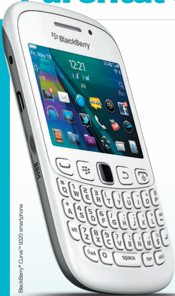
BlackBerry® Curve™ 9320 smartphone

Parental Controls are designed to help you have more control over how the features of the BlackBerry® smartphone are used.